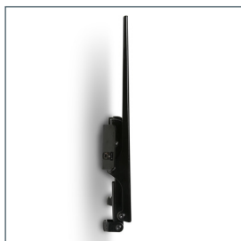
Low profile design mounts screen only 44mm (0.8") from wall