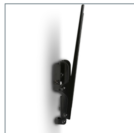
5 fixed tilt positions up to +15°