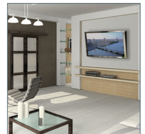
Easy to install in any home