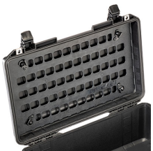
1535MP EZ-Click™ MOLLE Panel