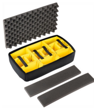
1535AirDS Padded Divider Set